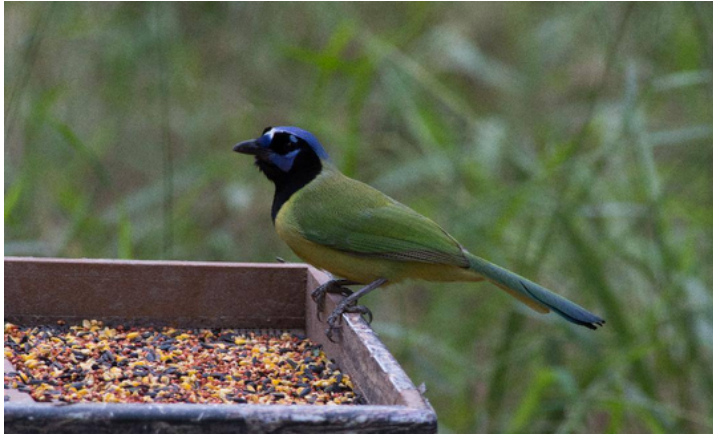
Green Jay