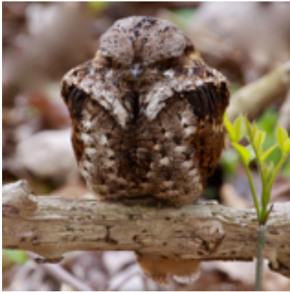
Eastern Whip-poor-will