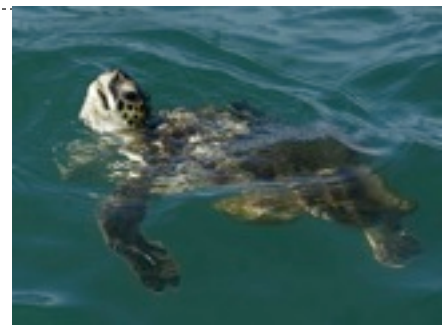
Amphibian photos by Chuck Tague