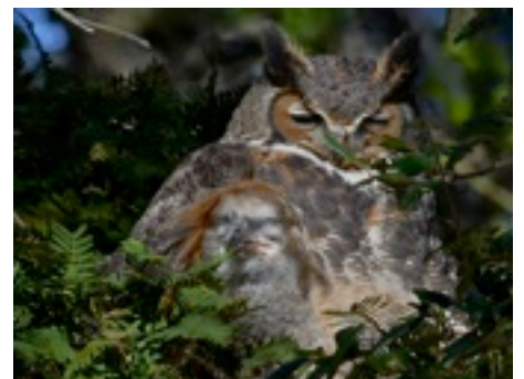
Great Horned Owl, "Bubo virginianus" by Chuck Tague