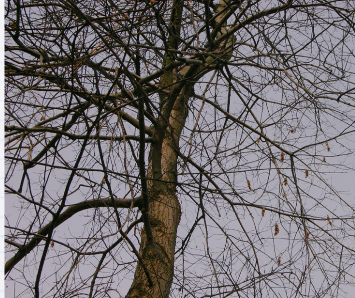
Hop Hornbeam