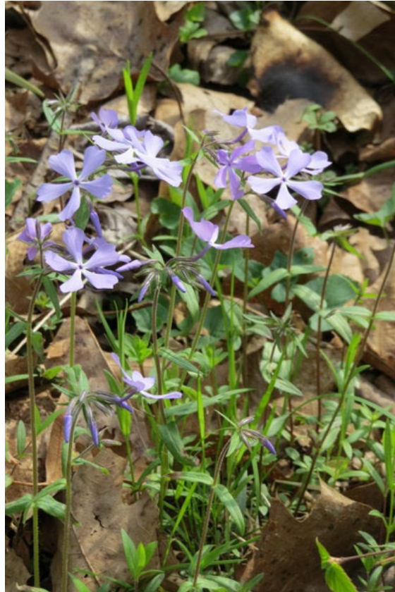
Wild Blue Phlox