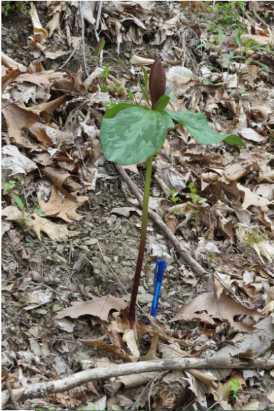
A really tall toadshade