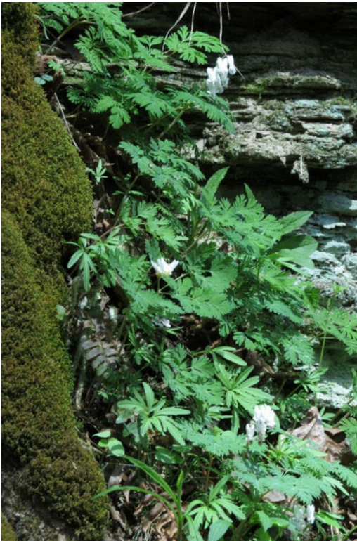
Squirrel Corn and Dutchman's Britches