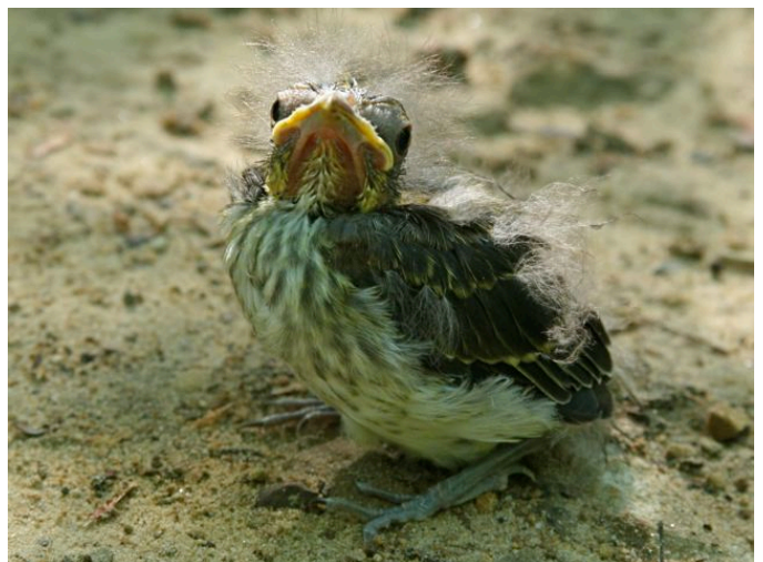
Fledglings Red-eyed Vireo and Scarlet Tanager by Chuck Tague