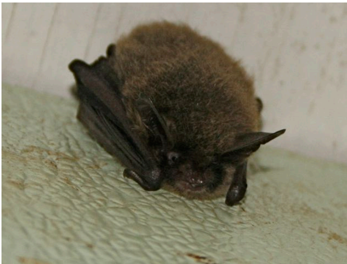
Big Brown Bat by Chuck Tague

ON APRIL 9, 7:30 P.M. TERRY LOBDELL WILL PRESENT BATS AND BAT HOUSES. BATS ARE HELPFUL CREATURES. THEY ARE SAFE AND BENEFICIAL TO HAVE IN YOUR BACKYARD. BAT HOUSES PROVIDE A SAFE HOME FOR BATS AND ARE EDUCATIONAL AND FUN FOR THE WHOLE FAMILY. BATS SIGNIFICANTLY REDUCE THE AMOUNT OF PEST INSECTS IN YOUR BACKYARD AND HELP FARMERS AND GARDENERS BY EATING INSECT PESTS. AN INDIVIDUAL BAT CAN EAT THOUSANDS OF INSECTS IN JUST ONE NIGHT! WHY USE PESTICIDES WHEN BATS CAN DO THE JOB.