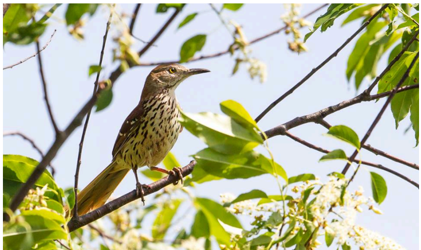
Brown Thrasher