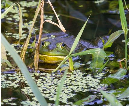
Frog by Bobby Greene

Loree Speedy 724.518.6022 mousemapper@verizon.net http://www.botsocwpa.org/