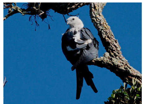
Swallow-tailed Kite

October 11, Saturday, 5:00 pm. Family Fishing. Join FHNC's certified fishing skills instructors for a fun Family Fishing program. Meet at the Nature Center then car pool to Soggy Bottom Lake , a private residence on Fern Hollow Road, to fish for Blue Gills, Bass, Carp, and Sunfish. Fern Hollow will provide all of the equipment necessary through our grant from the PA Fish and Boat Commission. $15 / $5.