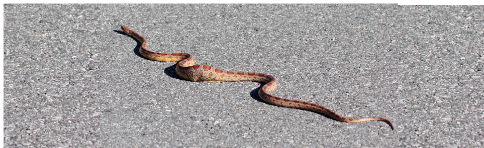
Corn Snake (Red Rat Snake}, "Pantherophis guttatus" by Chuck Tague

FALCONCAM HTTP://WWW.WQED.ORG/ BIRDBLOG/2014/03/03/WORKING- BOTH-ENDS-OF-TOWN/