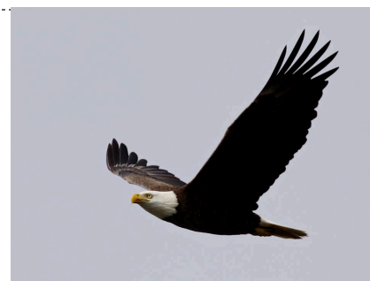
Bald Eagle, "Haliaeetus leucocephalus" coming in for the kill. Viera, Brevard County, FL 1-15-14.